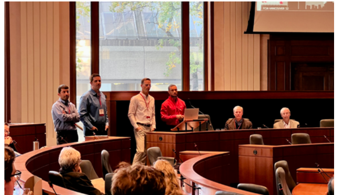
'Firestopping Basics for Combustible Pipes' panelists field a question from the audience.