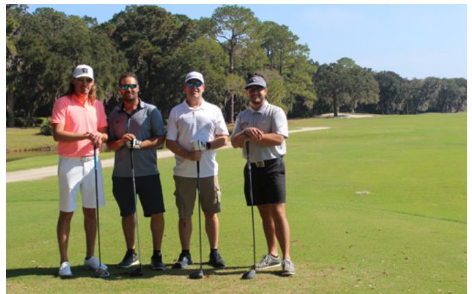
Golf with the President sponsors, Florida Firestop Systems, put their support to good use and took home the top prize.