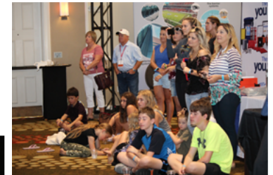
Family members watch as their loved ones are recognized during the FCIA Awards Lunch.