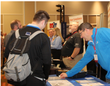
First-time FIC Exhibitors, Dolt, Revelation Door Inspections, and National Guard Products (NGP), meet potential customers during the FIC '22 Trade Show.

Watch FCIA.org Events Page for information on the upcoming ECA '23 Conference, heading to New Orleans next May 9-12, 2023!!