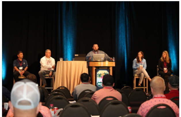
Panelists for 'The UL Technical Evaluation Developer Program for Engineering Judgements' tell FIC '22 attendees about the new program.

This evolving "Technical Evaluation" program is now available with most features already in place. Watch for more as we learn it.