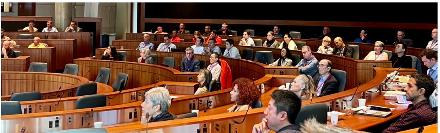
Canada-based Firestop Contractors, Code Officials, Fire Marshals, Architects, Specifiers, and Manufacturer Reps listen during the Canada Symposium.

Stay tuned to www.FCIA.org for more information on the Canada '23 event.